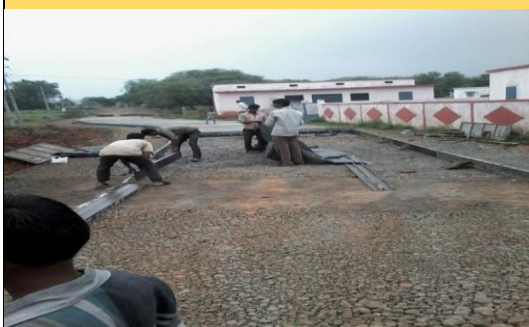
CC road construction