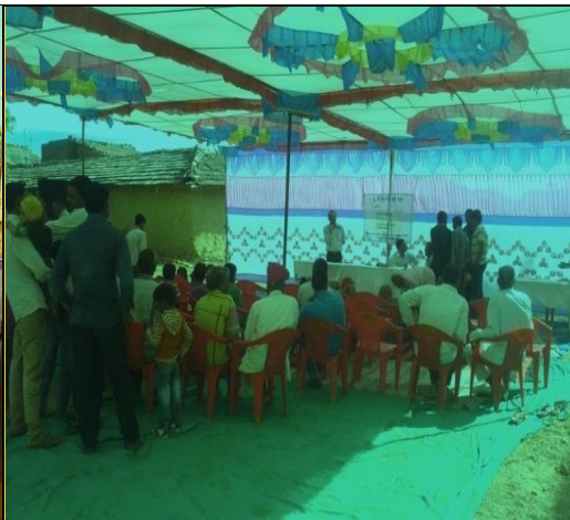
Health Awareness camp