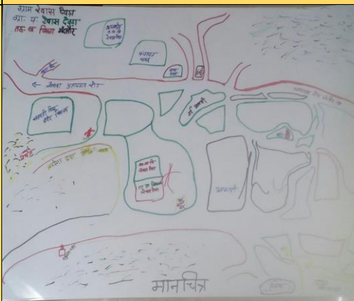
Social Mapping during Microplanning