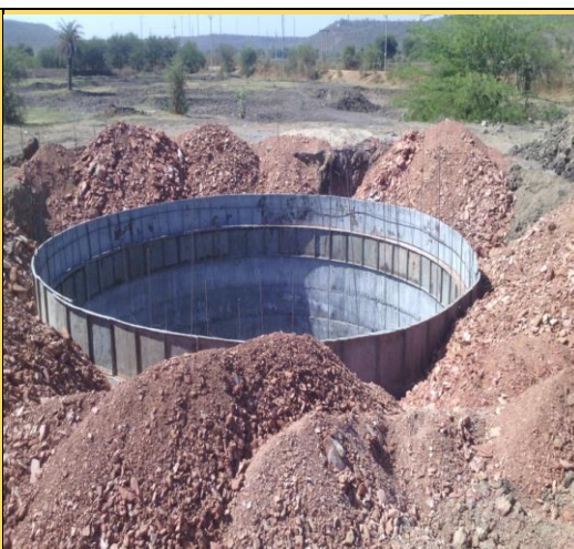
Digging of well and recharge