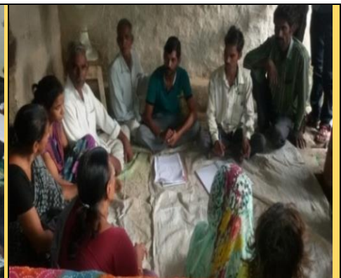
Nigrani Samiti meeting