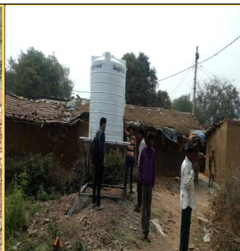
3000 ltr water tank installation