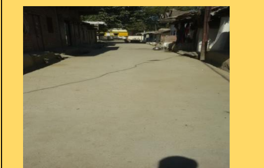
CC road constructed