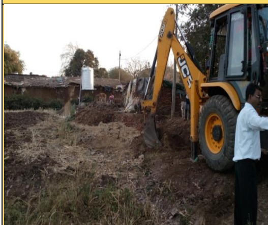
Laying 800 feet water pipeline