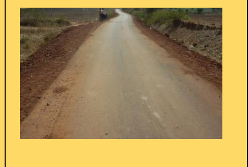
Bitumen covering of road