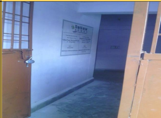
Lavatory constructed in a govt school