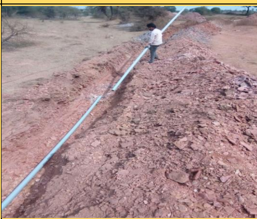
Laying 1600 feet water pipeline