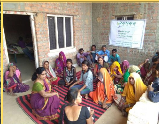
Nigrani saminit training