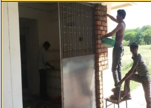
During construction of lavatories