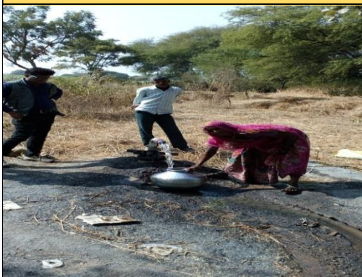
After boring and installation