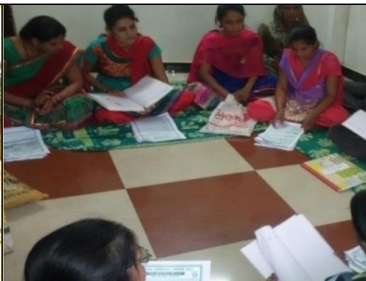
Soochna Kendra leaders training