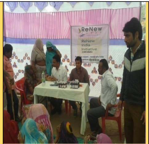
Health Check-up camp