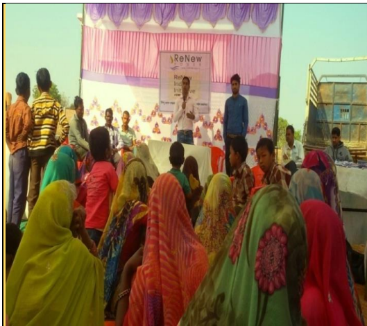
Financial inclusion awareness campaign