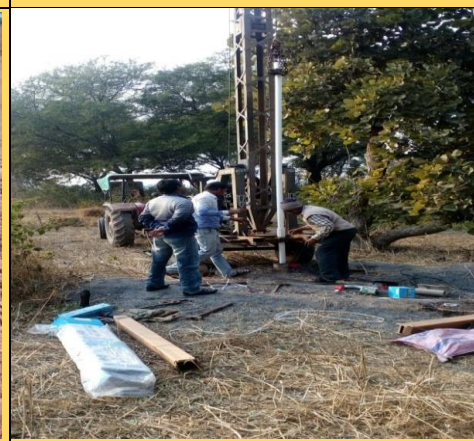
Boring and installation of motor